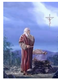
God Preached the Gospel To Abraham in a figure

Genesis 22:14 And Abraham called the name of that place Jehovahjireh: as it is said to this day, In the mount of the LORD it shall be seen.